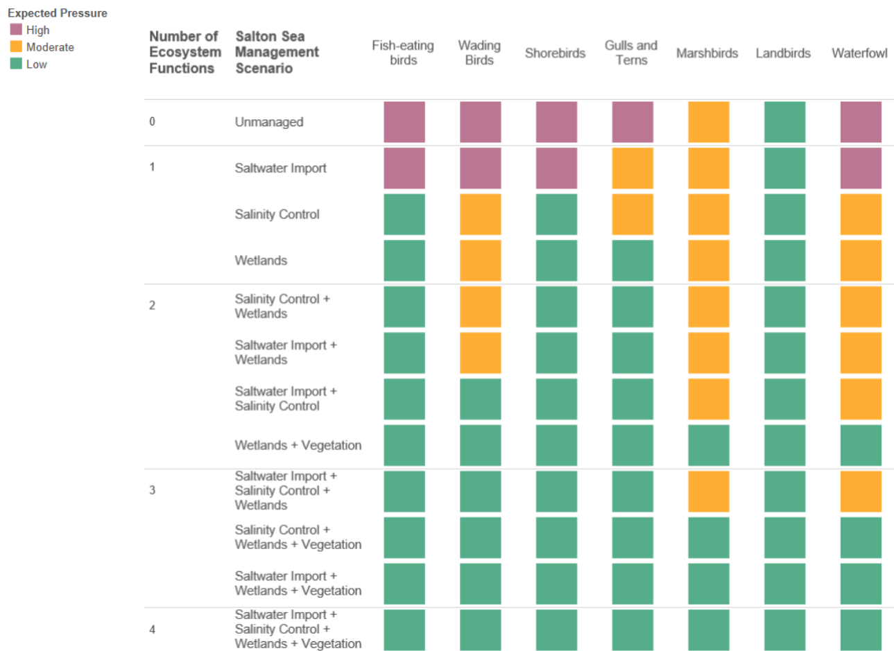
Figure 1: Matrix showing the potential impact of management strategies on bird groups at the Salton Sea. The vertical rows in the grid correspond to different management strategies and the horizontal columns correspond to bird groups. The scenarios are ordered by the number of ecosystem functions provided, shown in the first column. The color indicates the expected pressure of the scenario on the row on the bird group in the column. Green indicates little to no pressure, orange indicates moderate pressure, and red indicates high pressure. Pressure is based on the total food and habitat score for each scenario - bird group combination, as defined in section 3.3. An interactive version of the figure is available at: https://public.tableau.com/views/EcologicalRestorationPotentialofManagementStrategiesattheSaltonSea/InteractiveBirdType-ScenarioMap?:embed=y&:display_count=yes&publish=yes

Table 3 in the appendix shows the scores for each bird group and management scenario as well as reasons for each. The final step of the analysis aggregates the results from this scenario analysis to determine the pressure from each management